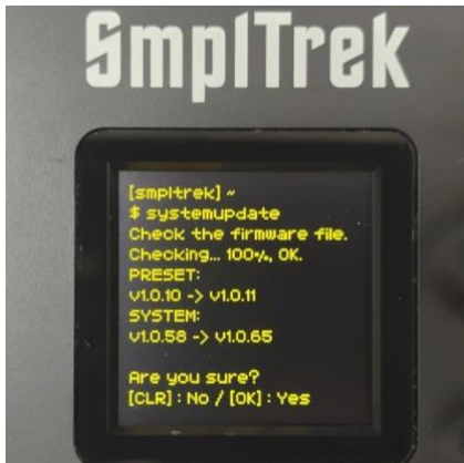
The screen display varies by the version.

*Never turn off the power while updating.